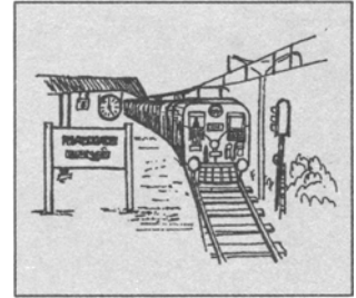
Figure 1 A train starts from a station at 5.00 p.m. Is its acceleration zero at 5.00p.m.? The 'zero speed implies zero acceleration' syndrome prevents most students from handling this question properly.

This example has become hackneyed - it is quoted at many places and many informed students would answer it correctly. But the intuitive notions, as said earlier, are robust - they may lie hidden in familiar problems of physics but will show up in unfamiliar contexts. Try another simple example on a class of undergraduates. A train starts from a station at 5.00 p.m. and reaches another station (a distance of 180 km) at 8.00 p.m. What is the average speed of the train? (Assume the path to be a straight line). What is the average acceleration? What is the speed of the train at 5.00 p.m.? Is the acceleration of the train zero at 5.00 p.m.? Is it zero at 8.00 p.m.? Students are unlikely to handle the latter parts of the question (earlier parts are trivial) correctly thus: the speed of the train at 5.00 p.m. and at 8.00 p.m. is zero. The acceleration at 5.00 p.m. and at 8.00 p.m. is not necessarily zero. Note, we have not said that the acceleration of the train must be non-zero at the starting and end points. A particle may have zero velocity and also zero acceleration at an instant, and yet may not remain at rest. For example, with position-time dependence of the type x(t) = t^3 , both velocity and acceleration are zero at t = 0 . A constant force cannot, of course, produce a dependence of this type but that is another matter.